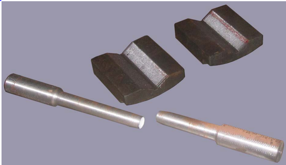
Jaw and broken steel bar

FANYUAN INSTRUMENT (HF) CO., LTD. DOWELL SCIENCE AND TECHNOLOGY (HK) CO., LTD. ADD: Tianyuan Road 9#, High-tech Zone, Hefei City, China Postal Code: 230088 TEL: +86-551-65232508 FAX: +86-551-65232507 Email: sales@hkdownell.com Website: http://www.fyichina.com.cn